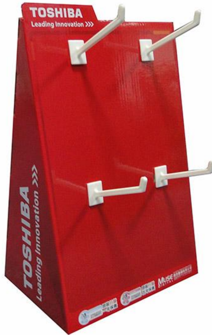
Sinst Cardboard Printed Counter Top Peg Hook Display Process