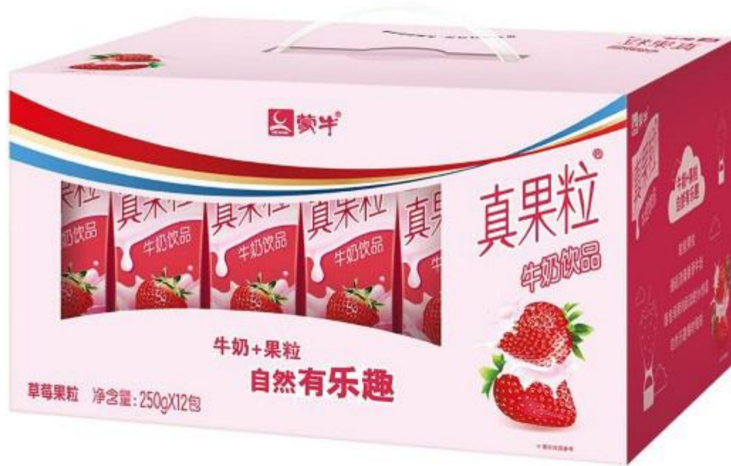
Sinst Printed Boxes for Fruit Juice Process